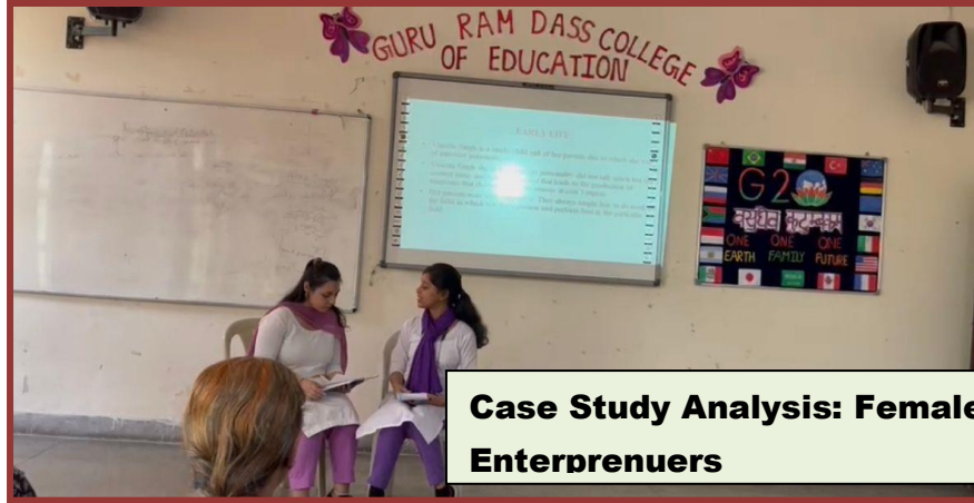
Case Study Analysis: Female Entrepreneurs